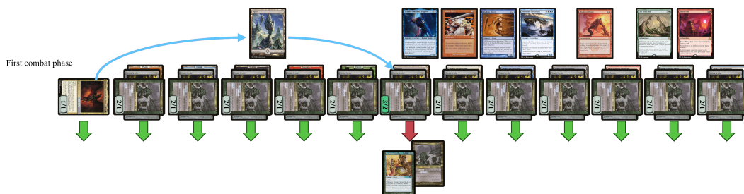
■ Figure 1 After Vaevictis Asmadi, the Dire puts a Wastes onto the battlefield, the only one of Alice’s attacking Dralnu’s Crusades which Bob’s Dream Fighter can block is the one given +1/+1 by a Strata Scythe imprinted with Wastes.

Bob controls a Dream Fighter (“Whenever Dream Fighter blocks or becomes blocked by a creature, Dream Fighter and that creature phase out”) with creature type Sliver and granted reach (so it can block creatures with flying). This blocks the 3/2 Dralnu’s Crusade , and they both phase out, so that creatures of the type corresponding to the current program permanent are no longer made Saprolings. We have a Shadow Sliver ensuring that only Slivers can block these Dralnu’s Crusades .