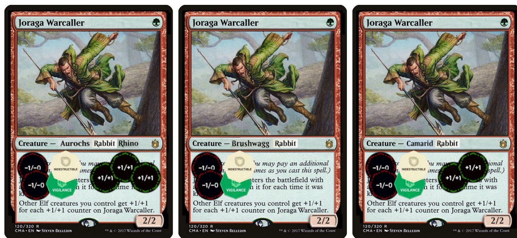
■ Figure 3 The first three registers. In this case r_0 has value 3, r_1 value 0 and r_2 value 2. If Z = 0 , the Dralnu’s Crusade making Aurochs into Saprolings is phased out and Bob’s Elves get +3/+3.

r_0 also has Rhino added to its creature types; this will be useful for some instructions that use specifically this register.