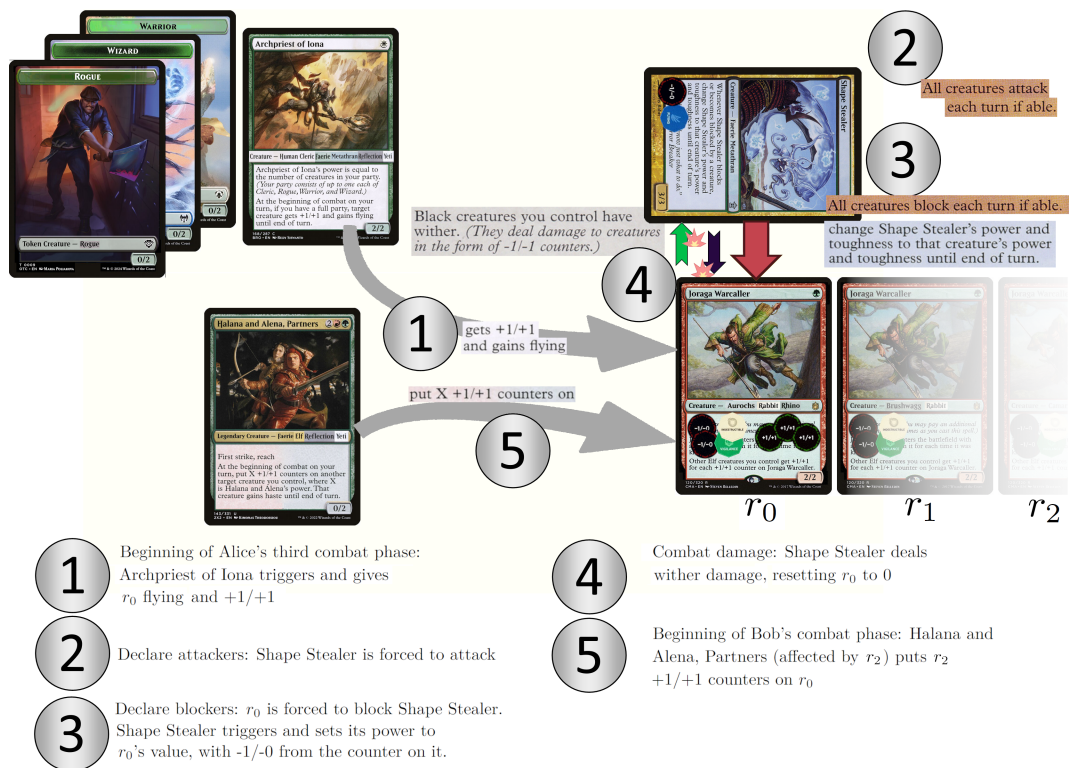
■ Figure 4 The five steps of instruction 5 0 2, Set r_0 r_2 .

When the third set of Dralnu's Crusades and the third Vaevictis Asmadi, the Dire attack, Alice's Shape Stealer with types X_5 Y_A is also forced to attack. The Dralnu's Crusades all have shadow, so r_0 can't block any of them; the only creature r_0 can block is the Shape Stealer . Shape Stealer's ability gives it base power equal to r_0 's value +1, which is why it has the -1/-0 counter so its actual power is r_0 's value. It is given wither because it is black, so the damage is dealt as -1/-1 counters, cancelling out all the +1/+1 counters on the register and setting r_0 's value to 0.